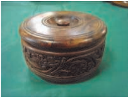
ANNA'S INTERSTING FIND