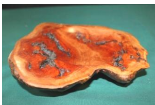
Burl - Lacquer