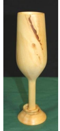
Huon Pine Stylewood