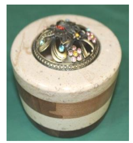
Corian & Walnut Friction Polish