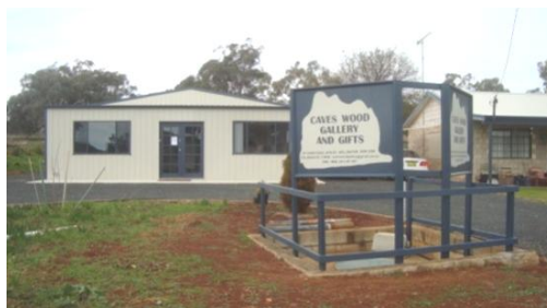
Its getting closer, signage almost up