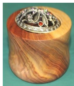
Camphor Friction Polish