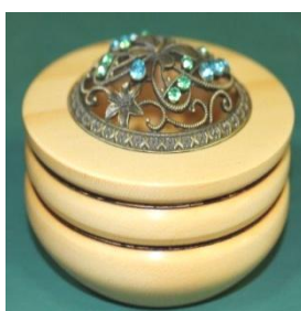
Huon Pine Friction Polish