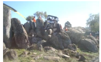
The action amongst the rocks, not always staying on four wheels.