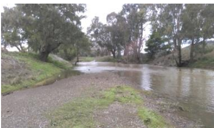
Had plenty of rain recently, river crossing flooded, first time we have seen it flooded.