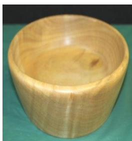
Camphor Friction Polish