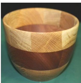
Oak & Sapele Friction Polish