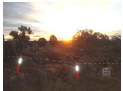
After setting up, started serving until dark. Fire box to keep warm and nice sunset