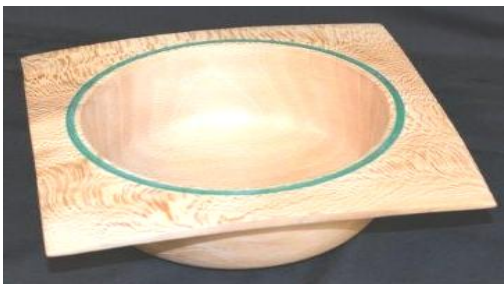
London Plane - Friction Polish