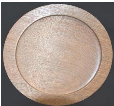
Jacaranda - unfinished