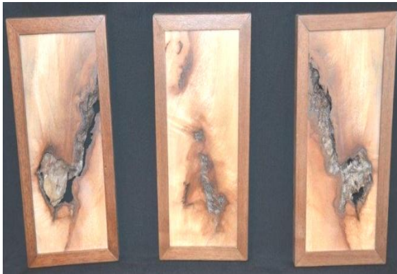
Camphor Laurel - Danish Oil