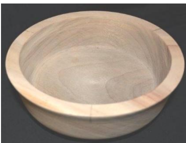
Camphor - unfinished