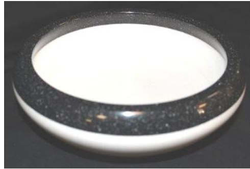
Corian - Polished