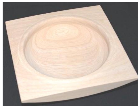
Jacaranda - unfinished