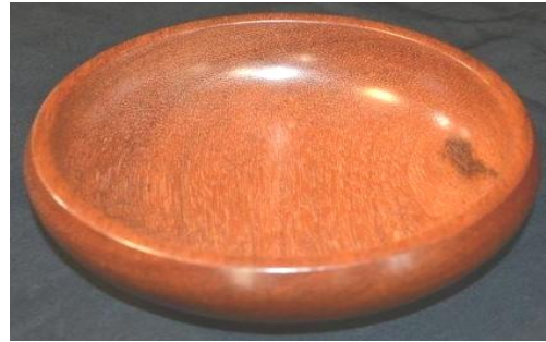
Rosewood - Friction Polish