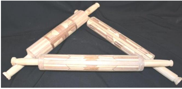
Various - unfinished