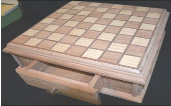
Various - unfinished