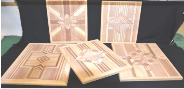
Various - unfinished