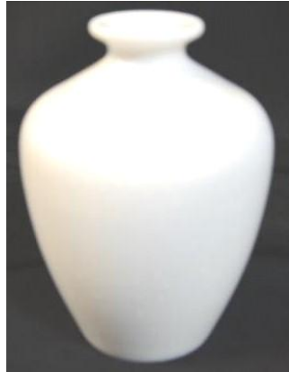
Corian - Polished