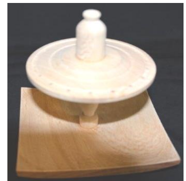
Jacaranda - unfinished