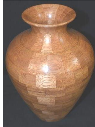
Maple - Stain and Danish Oil