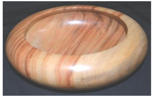
Camphor Laurel - Friction Polish