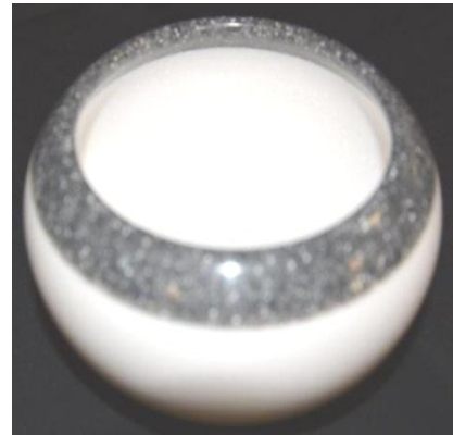
Corian - Polished