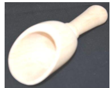
Jacaranda - unfinished