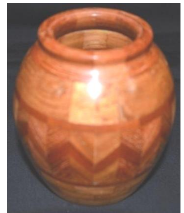
Rosewood & Mahogany - Friction Polish