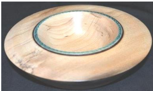
Blackheart Sassafras - Friction Polish