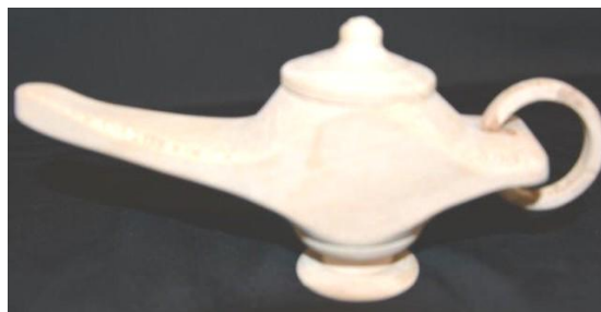
Jacaranda - unfinished