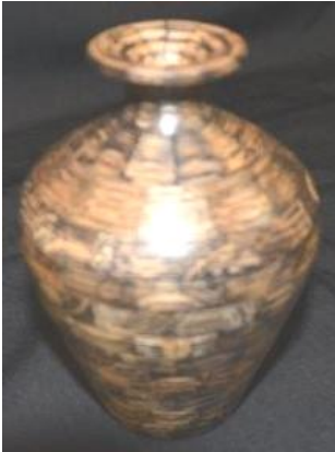
Oak - Ebonizing Solution then Danish oil