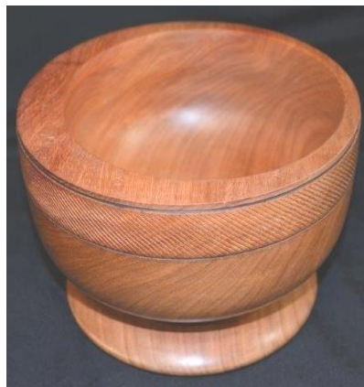
New Guinea Rosewood Friction Polish