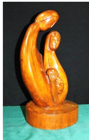
Cedar - Vanish