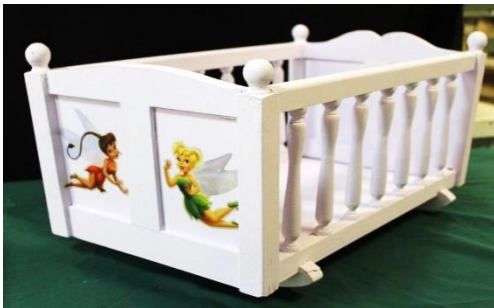
Pacific Maple – Ceiling Paint