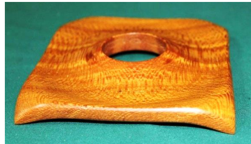
Banksia – Triple P