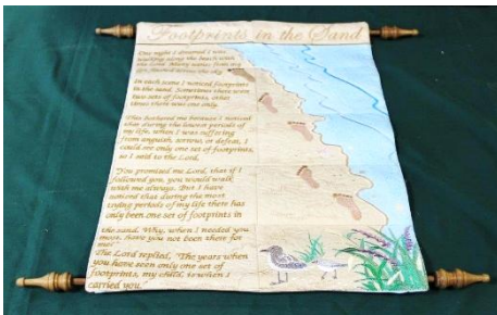
Structure Timber – Triple P & friction polish