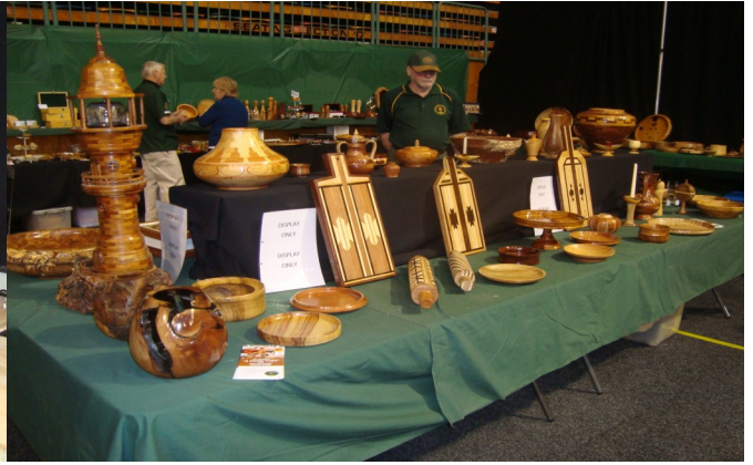
ABOVE: SALES & DISPLAY TABLES.