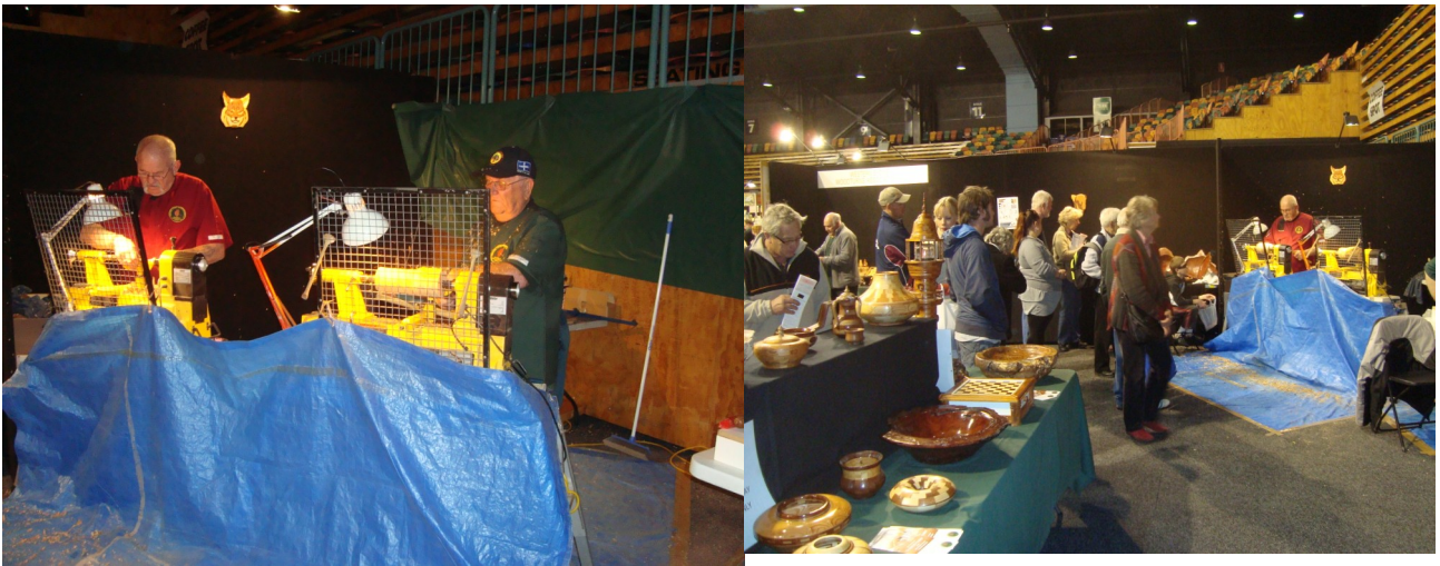
ABOVE: EL PRESIDENT & EL TRESURER BRINGING IN THE CROWDS