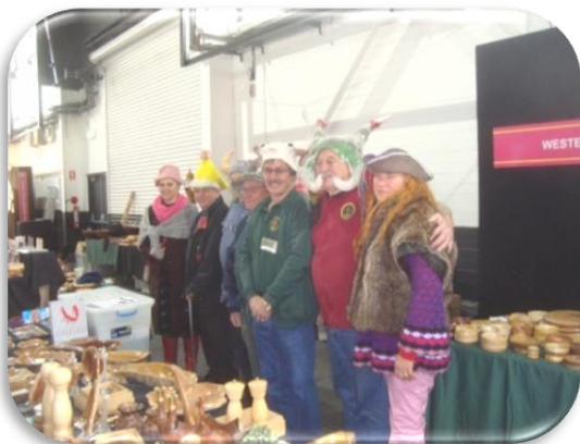
HAVING FUN WITH A NEARBY STAND