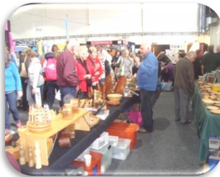
BUSY WITH SALES