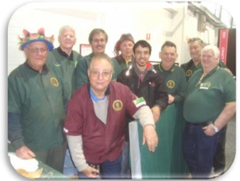
THE MALE ATTENDEES