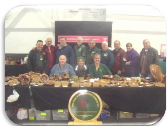
THE FULL MOB