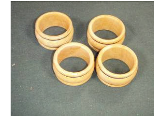
Erich Aldinger Serviette rings