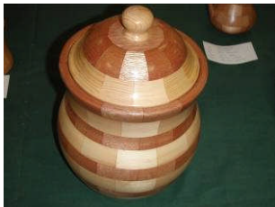
Ray Smith Laminated Cookie Jar