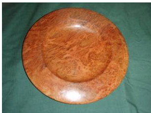
Stephen Hitchcock Burl platter