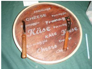
Rohan McCardell Cheese board and knives