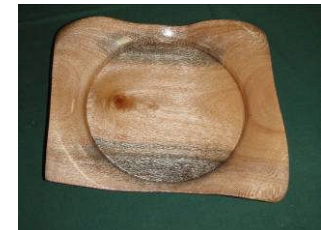
Erich Aldinger Silky Oak platter