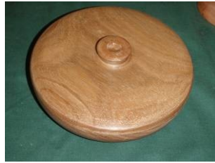
Steve Hitchcock; Lidded Bowl Syd. blue gum; Friction polish