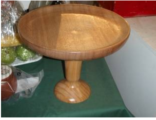
Alan Eipper; Cake stand Liquid amber, silky oak Friction polish