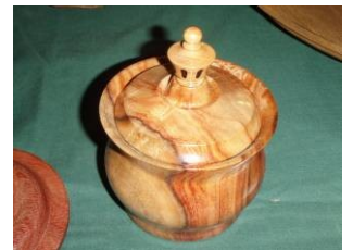
Erich Aldinger; Sugar bowl Camphor laurel; 7008