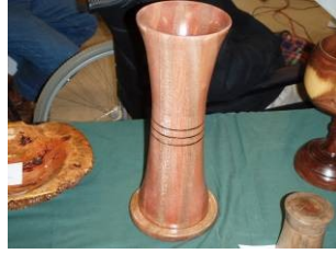
Dom Vaticano; Vase Maple; Estapol