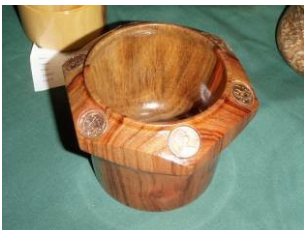
Erich Aldinger; Pencil box Camphor laurel; 7008