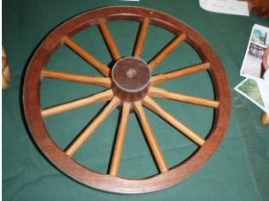
Les Pritchard Wheels