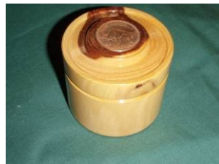
Erich Aldinger; Lidded box Mulga; 7008