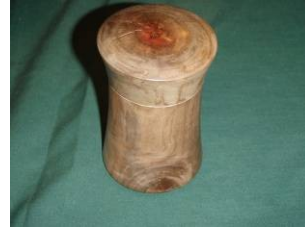
Steve Hitchcock; Lidded box Paper bark; Friction polish