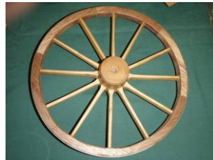
Les Pritchard Wheels