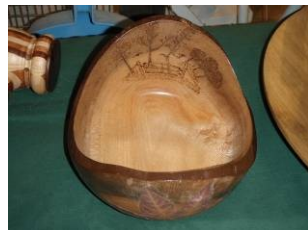
Erich Aldinger ; Bowl Silky oak; 7008