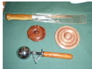
Bob Hodge (Santa) Kitchen repairs