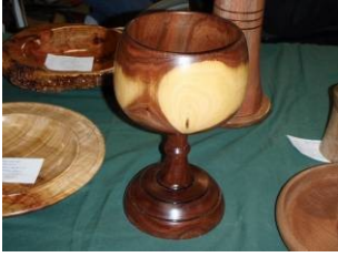
Dom Vaticano; Cup Mulga; Estapol