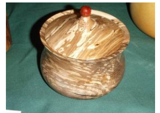
Neil Guthrie; Lidded box Spalted Jacaranda; 7008