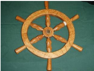
Les Pritchard Wheels