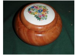
Alan Eipper; Trinket Dish Red gum; Friction polish Hand embroidered lid