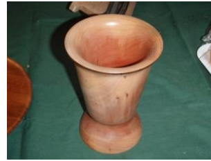
Alan Eipper; Vase Foundling; Friction polish