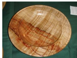
Neil Guthrie; Platter Camphor laurel; 7008