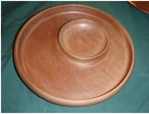
Steve Hitchcock; Offset plate Meranti; Kiwi boot polish