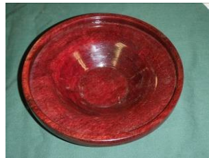
Dom Vaticano: Bowl Purpleheart Estapol