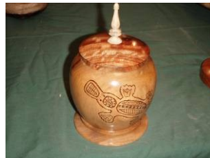
Erich Aldinger: Bowl Camphor & antler finial 7008