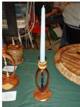
Erich Aldinger: Candle Holder; Gidgee, antler 7008