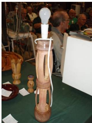
Dom Vaticano: Lamp Pine Estapol