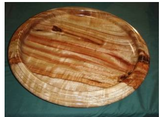
Erich Aldinger: Platter Camphor laurel 7008