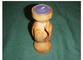
Dom Vaticano: Candle stick; Pine Estapol