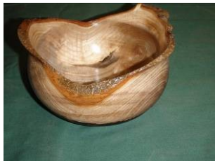
Erich Aldinger: Bowl Golden Ash Epiglass