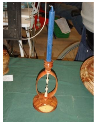
Erich Aldinger: Candle Holder; Mulga, Wenge 7008