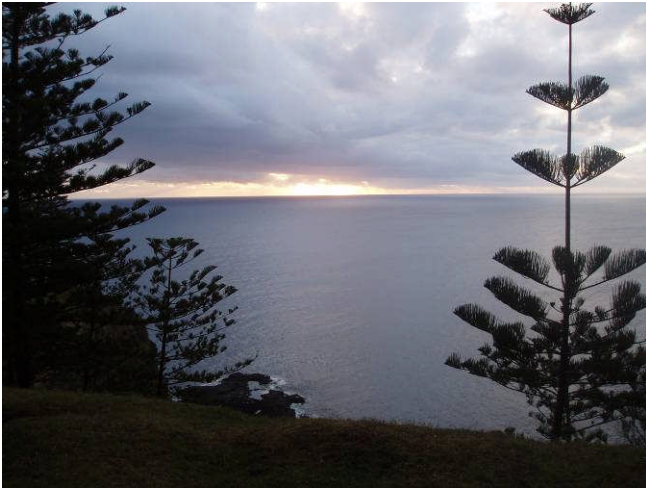
An island paradise

During a recent holiday on Norfolk Island, a local wood turner directed me to the nearby saw mill to have a look at the bottom section of a recently felled Norfolk Island pine.