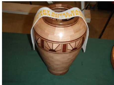
Ken Vodden; Segmented vase Tasmanian oak, jarrah, walnut Lacquer 3606