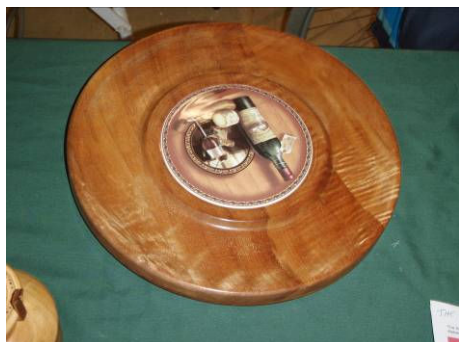
Fred de Jonge Cheese platter Friction polish