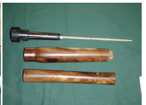
Manny Farrugia Versatile tool handle Gidgee; Friction polish