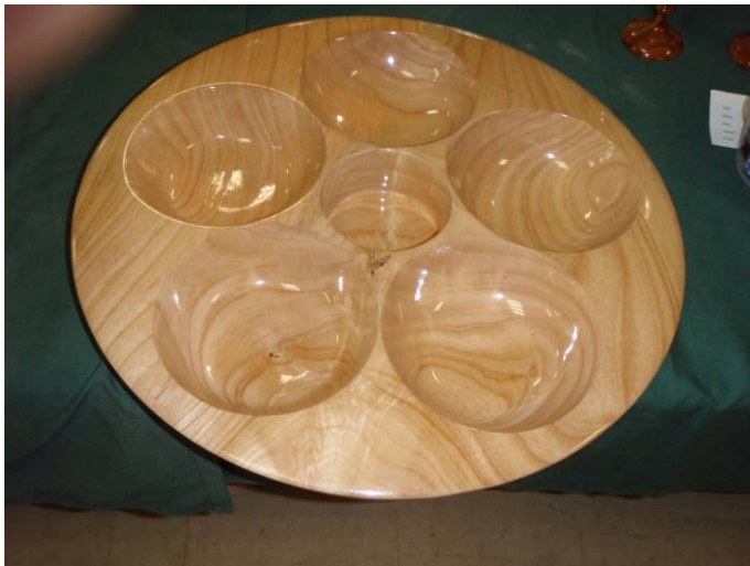
Above is a platter for a dip and crackers made using the OTGA jig.

Too high a pressure just blows away your small jobs!